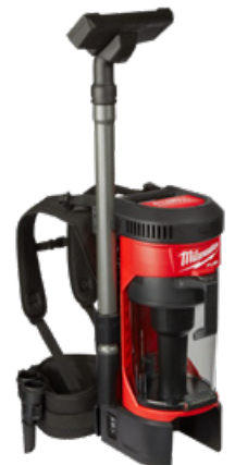
M18™ FUEL BACKPACK VAC