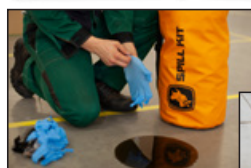
▲ Spill Kits Eco-Friendly Absorbents