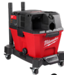
9 GAL M18™ FUEL VAC