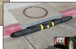
▼ Containment Heavy Equipment Concrete/Paint Washout