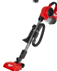
9 GAL M18™ FUEL VAC