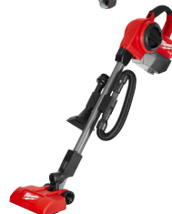
9 GAL M18™ FUEL VAC