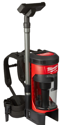
M18™ FUEL BACKPACK VAC