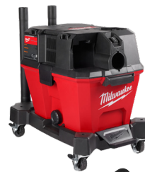
9 GAL M18™ FUEL VAC